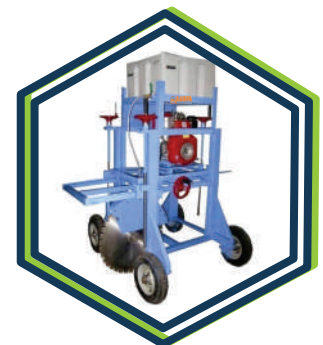
KERB CUTTING MACHINE