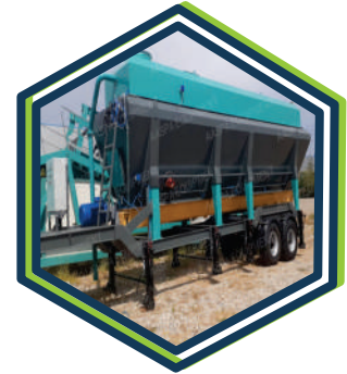
HORIZONTAL STOREGE SILO