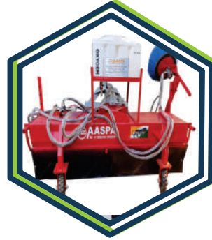
ROAD SWEEPER MACHINE