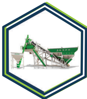
COMPACT CONCRETE BATCHING PLANT