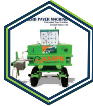
KERB PAVER MACHINE 100