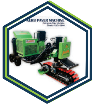
KERB PAVER MACHINE 1000