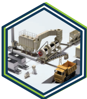
COUNTER FLOW DRUM MIX PLANT