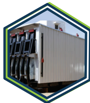
BITUMEN DRUM DECANDER