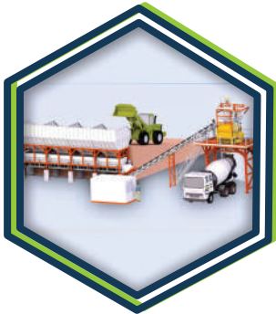
STATIONARY CONCRETE BATCHING PLANT