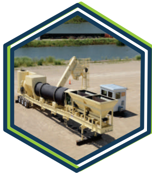
ASPHALT DRUM MIX PLANT