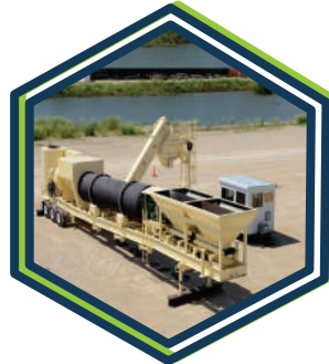
ASPHALT DRUM MIX PLANT