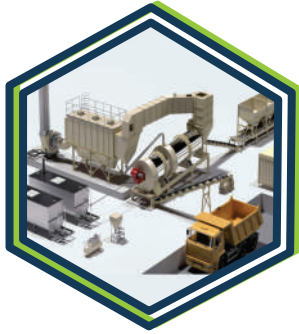
COUNTER FLOW DRUM MIX PLANT