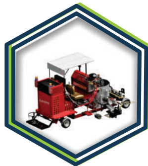
ROAD MARKING MACHINE