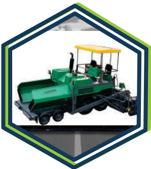
SENSOR ASPHALT PAVER