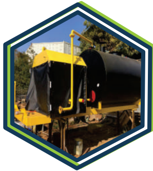
6 TON SPRAYER