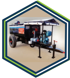
TRACTOR MOUNTED BITUMEN APAYER 2.5 TO 5 TON