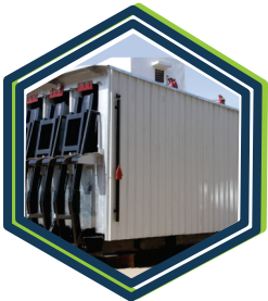
BITUMEN DRUM DECANDER