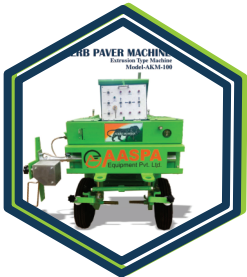
KERB PAVER MACHINE 100