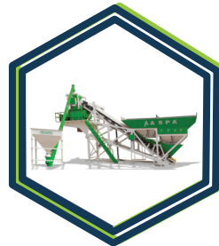
COMPACT CONCRETE BATCHING PLANT