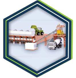
STATIONARY CONCRETE BATCHING PLANT