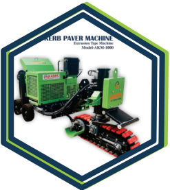
KERB PAVER MACHINE 1000