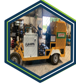
FULLY AUTOMATIC ROAD MARKING MACHINE