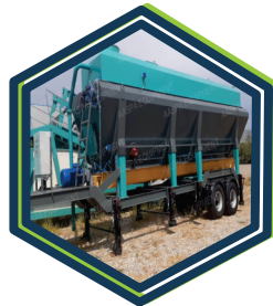
HORIZONTAL STORAGE SILO