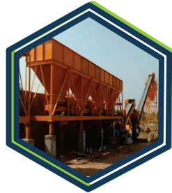
WET MIX MACADAM PLANT