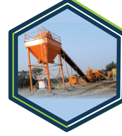
WET MIX DLC PLANT