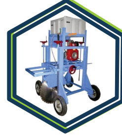
KERB CUTTING MACHINE