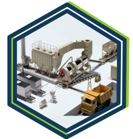
COUNTER FLOW DRUM MIX PLANT