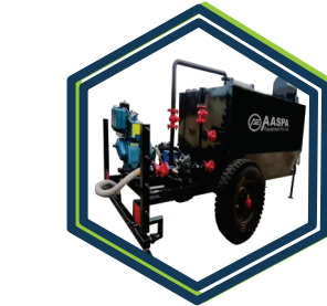
BITUMEN EMULSION SPAREYER