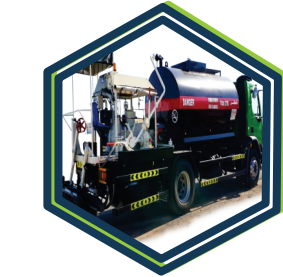
BITUMEN PRESSURE DISTRIBUTOR