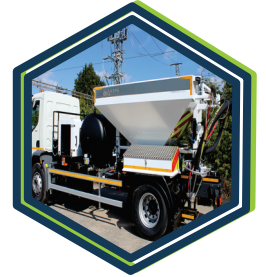
AASPA POTHOLE PATCHER WORKING PROCESS