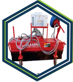
ROAD SWEEPER MACHINE