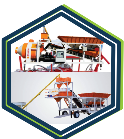
MOBILE CONCRETE BATCHING PLANT