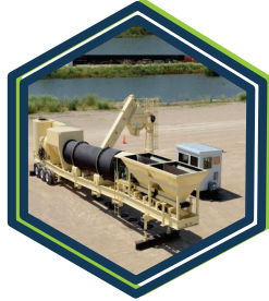
ASPHALT DRUM MIX PLANT