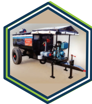
TRACTOR MOUNTED BITUMEN APAYER 2.5 TO 5 TON