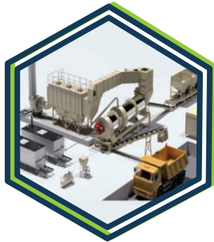
COUNTER FLOW DRUM MIX PLANT