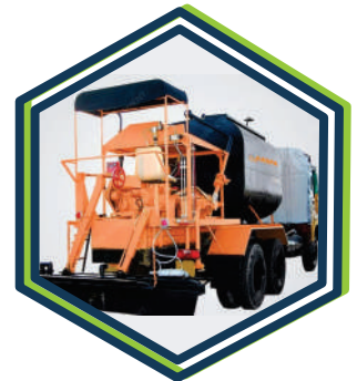
PRESSOR MOUNTED BITUMEN SPRAYER