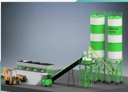
STATIONARY CONCRETE BATCHING PLANT