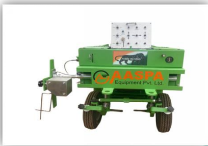
KERB PAVER MACHINE 100