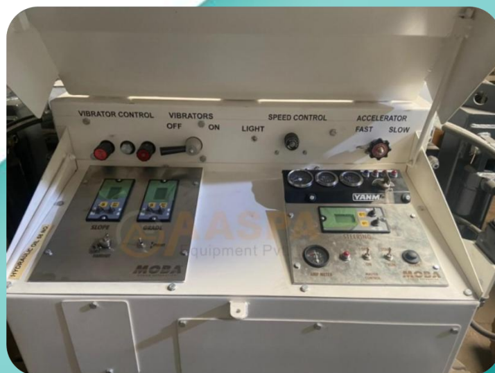
MOBA MOBILE AUTOMATION

THE AASPA XL750 SLIPFORMER IS NOW FITTED WITH THE NEW MOBA SENSING SYSTEM. AN INTEGRATED DIGITAL CONTROL SYSTEM FOR ALL FUNCTIONS ALLOW THE OPERATOR MORE FLEXIBILITY WITH PRESS BUTTON CONTROL AND DIGITAL DISPLAY FAULT FINDING.