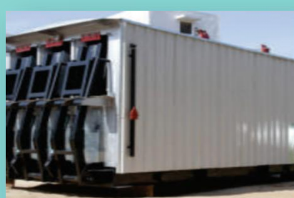
BITUMEN DRUM DECANDER