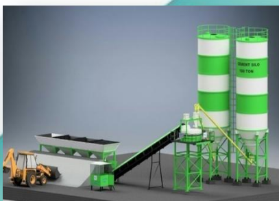
STATIONARY CONCRETE BATCHING PLANT