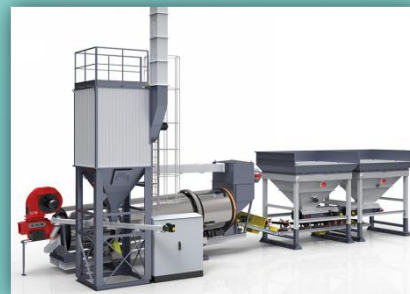
COUNTER FLOW DRUM MIX PLANT