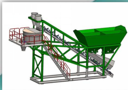
COMPACT CONCRETE BATCHING PLANT