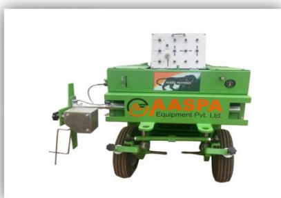
KERB PAVER MACHINE 100