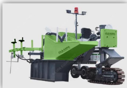
KERB PAVER MACHINE 1000