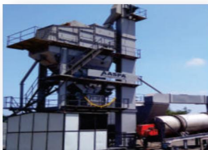
ASPHALT BATCH MIX PLANT