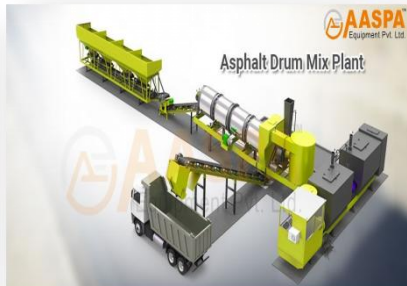
ASPHALT DRUM MIX PLANT