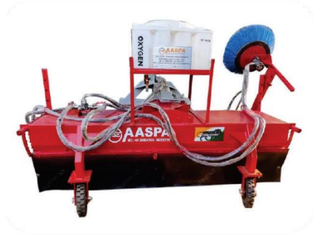
BUCKET BROOMER WITH SIDE BRUSH AND WATER SPRAYING SYSTEM