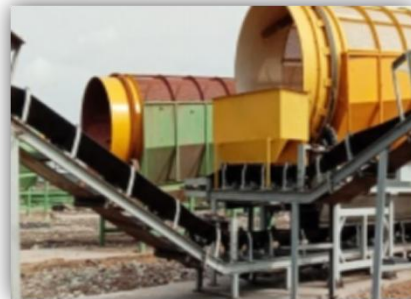
SEGRIGATION COMPOST MACHINE