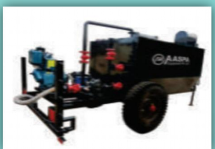
BITUMEN EMULSION SPAREYER