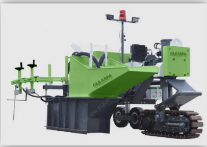
KERB PAVER MACHINE 1000