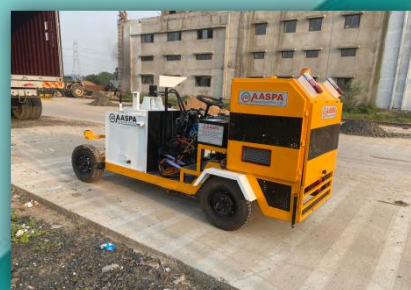
FULLY AUTOMATIC ROAD MARKING MACHINE