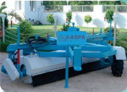
MECHANICAL HYDROLIC BROOMER