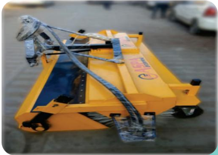
HYDRAULIC BUCKET BROOMER