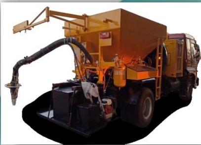
STATIONARY CONCRETE BATCHING PLANT