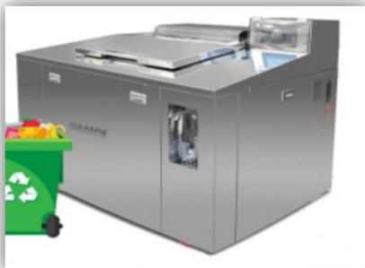
WASTE COMPOST MACHINE