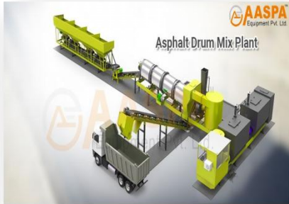
ASPHALT DRUM MIX PLANT