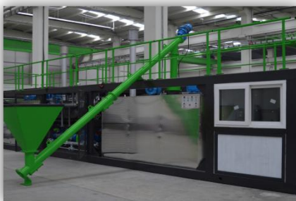
BITUMEN EMULSION PLANT