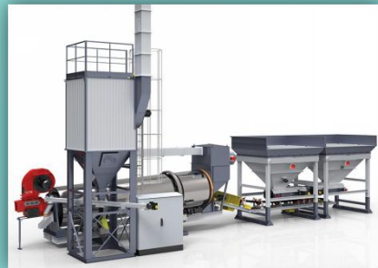
COUNTER FLOW DRUM MIX PLANT