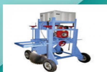
KERB CUTTING MACHINE