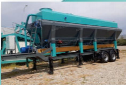
HORIZONTAL STOREGE SILO