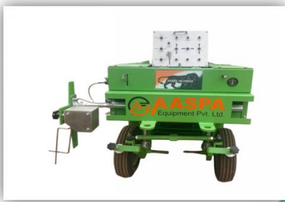
KERB PAVER MACHINE 100