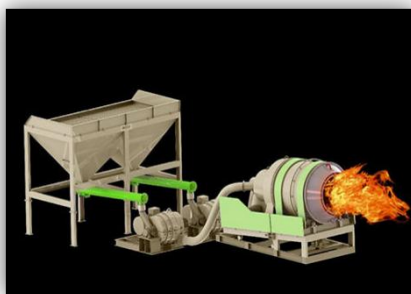
COAL FIRED BURNER