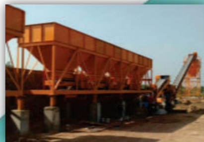
WET MIX MACADAM PLANT/DLC PLANT