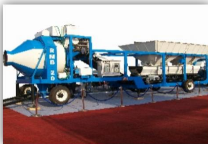
REVERSIBLE BATCHING PLANT