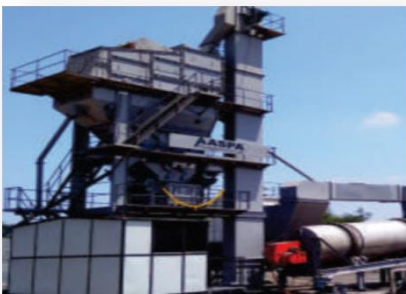
ASPHALT BATCH MIX PLANT