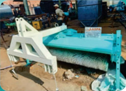
HYDRAULIC BUCKET BROOMER