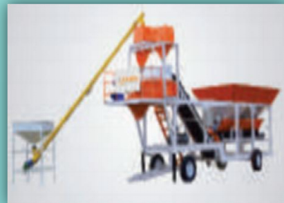
MOBILLE CONCRETE BATCHING PLANT