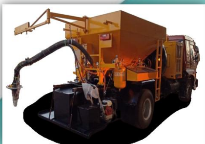
AASPA POTHOLE PATCHER WORKING PROCESS