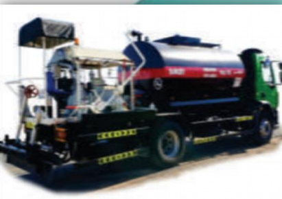
BITUMEN PRESSURE DISTRIBUTOR