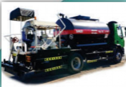
BITUMEN PRESSURE DISTRIBUTOR