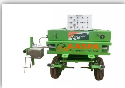
KERB PAVER MACHINE 100