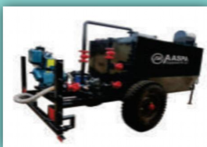
BITUMEN EMULSION SPAREYER