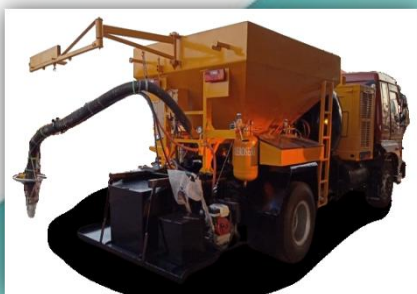
AASPA POTHOLE PATCHER WORKING PROCESS