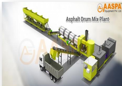
ASPHALT DRUM MIX PLANT